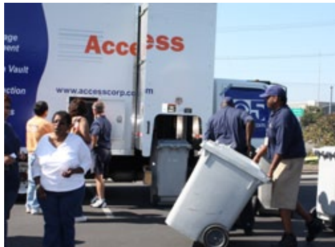
People dropping off their shredding at Community Shred Day