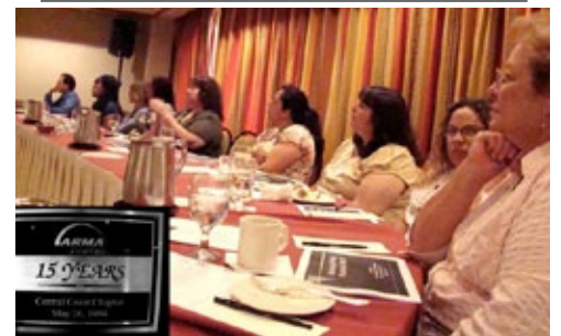
ARMA central Coast Chapter Meeting in Santa Barbara celebrating the 15 year Anniversary.

For more conference details, please visit the ARMA Conference website at http://www.arma.org/conference/2009/